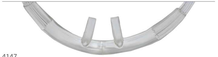
4147 High Flow O 2 Cannula / FRONT DETAIL