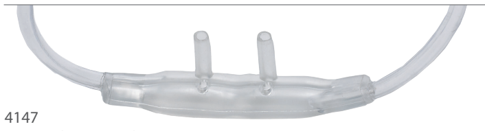
4147 Demand O 2 Cannula / BACK DETAIL