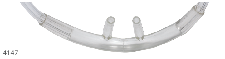
4147 High Flow O 2 Cannula / BACK DETAIL