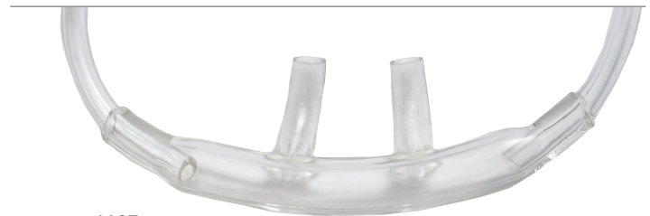
1107 Adult O 2 Cannula / BACK DETAIL