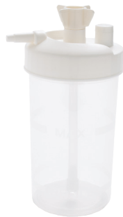
High flow bubble humidifier (6-15 LPM) features 6 PSI (414 mbar) pressure relief valve