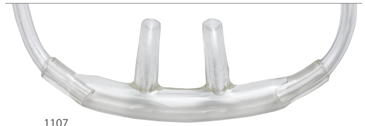
1107 Adult O 2 Cannula / FRONT DETAIL