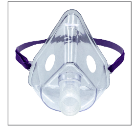
Adult or pediatric non-vented mask options

The Circulaire® II nebulizer system delivers medication in a fraction of the time while eliminating wasted medication during exhalation. A bacterial/viral filter can also be used to help protect caregivers from potentially harmful bioaerosols.