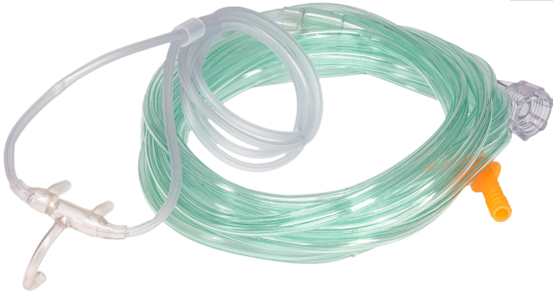
0913 Oral/Nasal Cannula